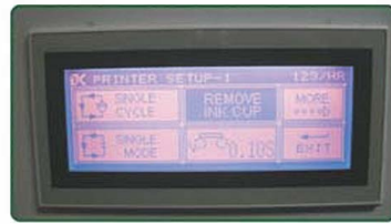
PLC control touch screen panel