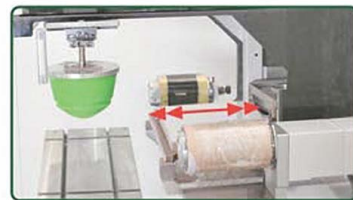
Platform in / out movement & pad clean underneath design for max. product size