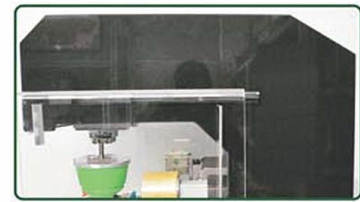
Stable granite stone machine structure